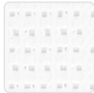
9oz MESH VINYL