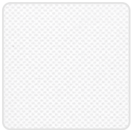
18oz BLOCKOUT VINYL