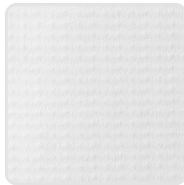
13oz SCRIM VINYL